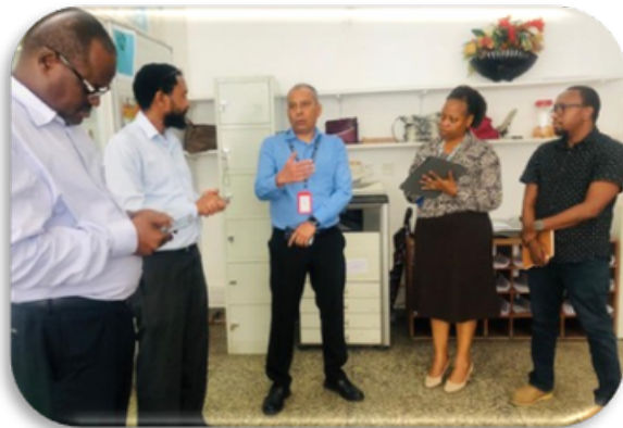
CDC TANZANIA TEAM AT CTRL

In Tanzania, the Ministry of Health and the CTRL have significantly improved TB testing by introducing TrueNat machines to 37 facilities since May 2023. This initiative has facilitated 2,572 TB tests, detecting 234 TB cases, including seven drug-resistant TB cases. By reviewing policies, developing training materials, and ensuring test quality, CTRL plays a crucial role in the achievement of this programme. Their efforts include enrolling facilities in proficiency testing and securing machine procurement through the Global Fund. CTRL's dedication to TB elimination earns them recognition as TB Elimination Champions.