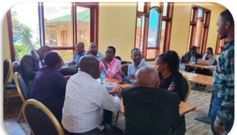
Training on updated TB Diagnostic Algorithm to Regional TB and Leprosy Coordinators (RTLCS)